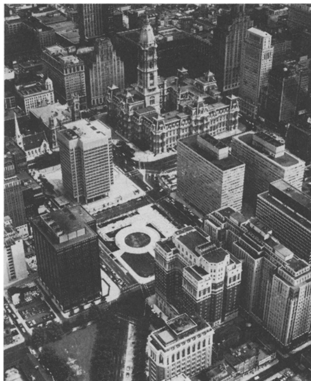
Downtown Penn Center at right